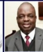
Dr. Alex Egbona Member, Representing Akwa Ibom Federal Constituency, Abuja