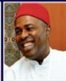
Dr. Ogbonnaya Onuu Minister of Science and Technology, Abuja