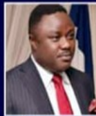
Prof. Ben Ayade Governor, Cross River State

Time: 10am Prompt For more information call: +234 811 1800 862, +234 811 4431 313, +234 703 4451 163