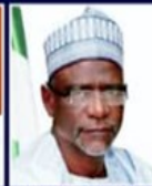
Mallam Adamu Adamu Minister of Education, Abuja