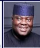
Sen. Prof. Sandy Onor Senator, Representing Cross River Central Senatorial District, Abuja